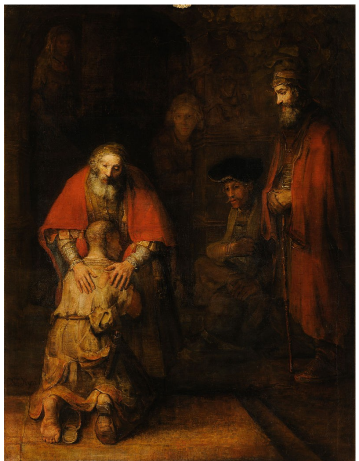
The Return of the Prodigal Son, Rembrandt