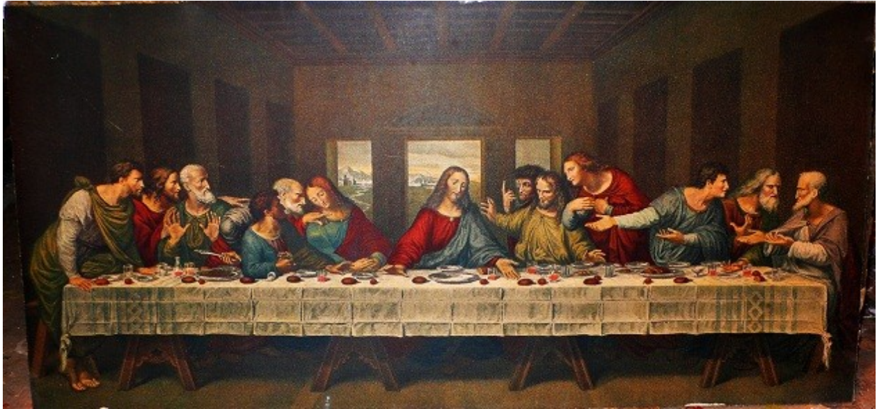
The Last Supper, Leonardo da Vinci