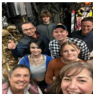
Youth and volunteers--after surviving the Haunted Mansion!

Youth and Children's ministries at FPCL have also been active in outreach during the month of October. , October 13 th , some hardy teenagers and adult volunteers braved the "Haunted Mansion" in the famed Reinke Brothers costume store in downtown Littleton. After we'd all been sufficiently frightened, we then recovered across the street with some delicious ice cream from Inside Scoop! It was a festive night of fellowship! Then the very next day, on Saturday, October 14 th —a group of children and parents gathered at Denver Botanic Gardens' Chatfield Farms location for a perfect autumn activity—visiting a corn maze and pumpkin patch! The kids had a wonderful time outside, and also got to enjoy a tractor-drawn "train ride" and a hayride. Best of all, as a special souvenir of their day out, they got to each pick out a pumpkin to take home.