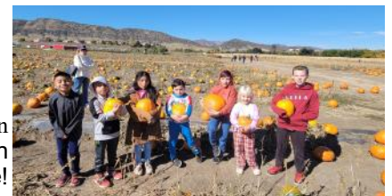
Each child had fun picking out a pumpkin to take home!