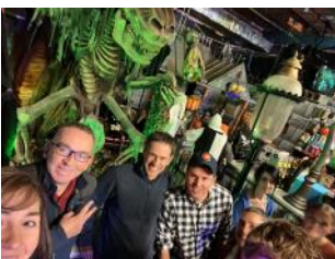
Youth and volunteers--before entering the Haunted Mansion!

Youth and Children's ministries at FPCL have also been active in outreach during the month of October. , October 13 th , some hardy teenagers and adult volunteers braved the "Haunted Mansion" in the famed Reinke Brothers costume store in downtown Littleton. After we'd all been sufficiently frightened, we then recovered across the street with some delicious ice cream from Inside Scoop! It was a festive night of fellowship! Then the very next day, on Saturday, October 14 th —a group of children and parents gathered at Denver Botanic Gardens' Chatfield Farms location for a perfect autumn activity—visiting a corn maze and pumpkin patch! The kids had a wonderful time outside, and also got to enjoy a tractor-drawn "train ride" and a hayride. Best of all, as a special souvenir of their day out, they got to each pick out a pumpkin to take home.