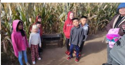
FPCL kids enjoyed getting lost in the corn maze!