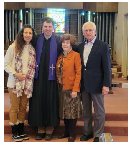
I was fortunate to have my parents come from Alabama to hear me preach on October 26th