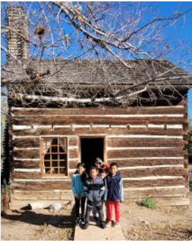
Children's Event at the Littleton Museum