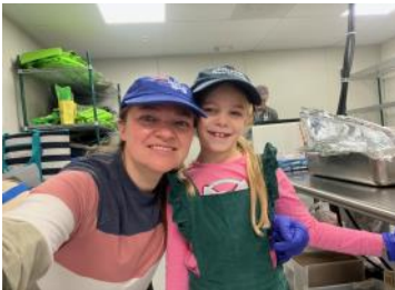
Two of our amazing Thanksgiving volunteers!