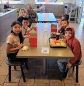
Enjoying lunch at McDonald's after our visit to the Littleton Museum

During November, our FPCL Children's and Youth ministries also celebrated some special outreach events. On Saturday, November 4 th , we took a group of kids and adult volunteers out to the Littleton Museum. This was a fascinating outdoor outing for all as we got to see some historic buildings, including a farmstead with animals, and a blacksmith's shop, which the kids really enjoyed! And to top it off, the kids got to have lunch at McDonald's afterwards! Then on Saturday, November 18 th our FPCL Youth Group faced a challenging test of wits at the Mystic Escape Rooms in downtown Littleton. If you've never experienced one before, an Escape Room is an interactive adventure in which you and your teammates have to discover clues to solve a series of puzzles in order to reach your goal—all in under an hour. Even though not all of us managed to "escape" our rooms in time, we all enjoyed each other's company in a great teamwork building exercise. And then afterwards it was lunch at, you guessed it—McDonald's! I think the youth enjoyed going there just as much as the kids a few weeks before haha. And so did I! With Christmas rapidly approaching, we'll be having some more seasonal outreach events for both FPCL Children and Youth in the coming weeks. Thank you so much to everyone who supports these ministries, helping to connect the next generations to the congregational life of our church!